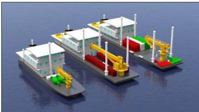
Figure 2. Coast Guard Notional Designs for WLR, WLIC, and WLI

Source: Coast Guard illustration showing indicative (i.e., notional) designs for the WLR (right), WLIC (middle), and WLI (left).